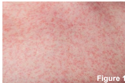
Figure 1: Macro of skin with rash from dengue disease.

Department of Bioscience and Biotechnology, Banasthali Vidyapith, Jaipur, India