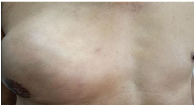
Figure 1: Image showing the right breast swelling of the patient.

3 Department of Nephrology, Mohammed V Military Teaching Hospital, Rabat, Morocco