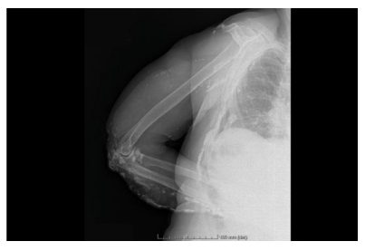
Figure 2: Plain film radiograph of her right forearm.