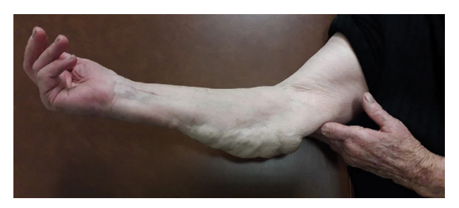
Figure 1 : Subcutaneous petrous nodules in the right forearm of the patient.

<sup>1</sup>Department of Physical Medicine and Rehabilitation, Centro Hospitalar Tondela-Viseu, Portugal <sup>2</sup>Faculdade de Medicina Dentária, Universidade Católica Portuguesa, Viseu, Portugal