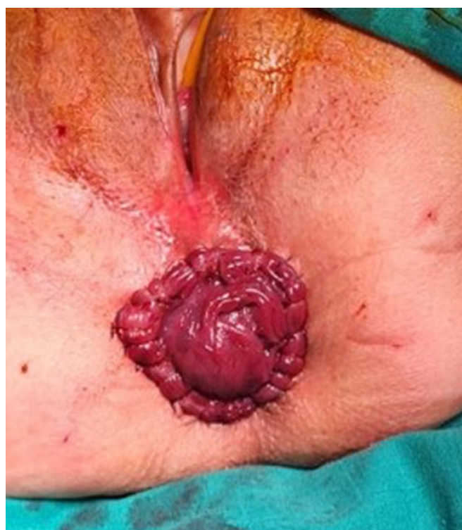
Figure 4: Appearance of the colo-perineal anastomosis.