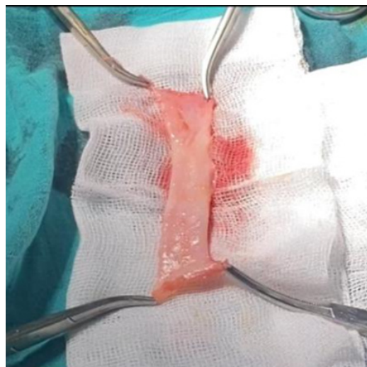
Figure 2: Folded muscle sleeve.

Received: 24 June 2023, Manuscript No. ijcmi-23-103713; Editor assigned: 26 June 2023, Pre QC No. P-103713; Reviewed: 14 July 2023, QC No. Q-103713; Revised: 18 July 2023, Manuscript No. R-103713; Published: 25 July 2023, DOI:10.4172/2376-0249.1000904