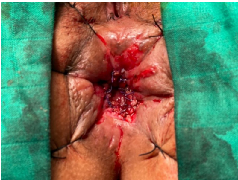
Figure 5: Appearance of the anastomosis: After the 2 nd time.

functional results after colo-anal anastomosis we propose a modification of the colo-anal anastomosis technique, which will be performed in two stages with sphincter reinforcement, which has been nicknamed delayed and reinforced colo-anal anastomosis. This article aims to describe this new surgical procedure and to evaluate the first functional and surgical results.