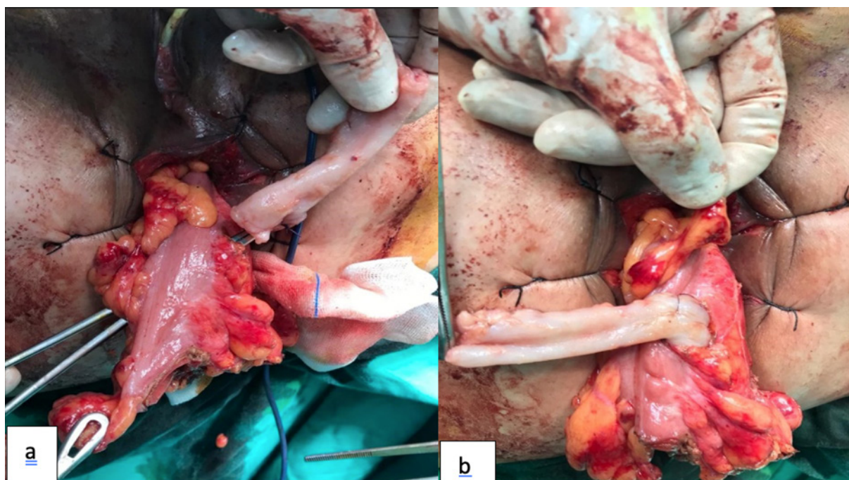
Figure 3a, 3b: Sleeving procedure.