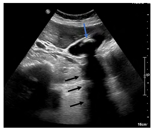
Figure 2: Abdominal ultrasound: Presence of multiple hyperechoic formations (blue arrow) with posterior accoustic shadow (black arrows) related to gallstones.