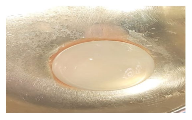
Figure 3: Complete cyst removal.