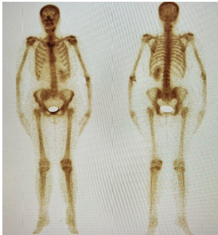
Figure 3: Bone scintigraphy.